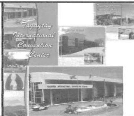
Panoramic View of TICC