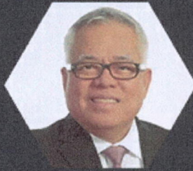
SEC. RAMON LOPEZ Secretary Department of Trade and Industry