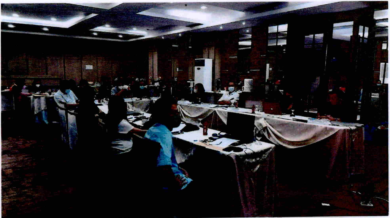
The Project Management Committee (PMC) members during the 2nd Semester PMC Meeting at Smallville 21 Hotel in Iloilo City