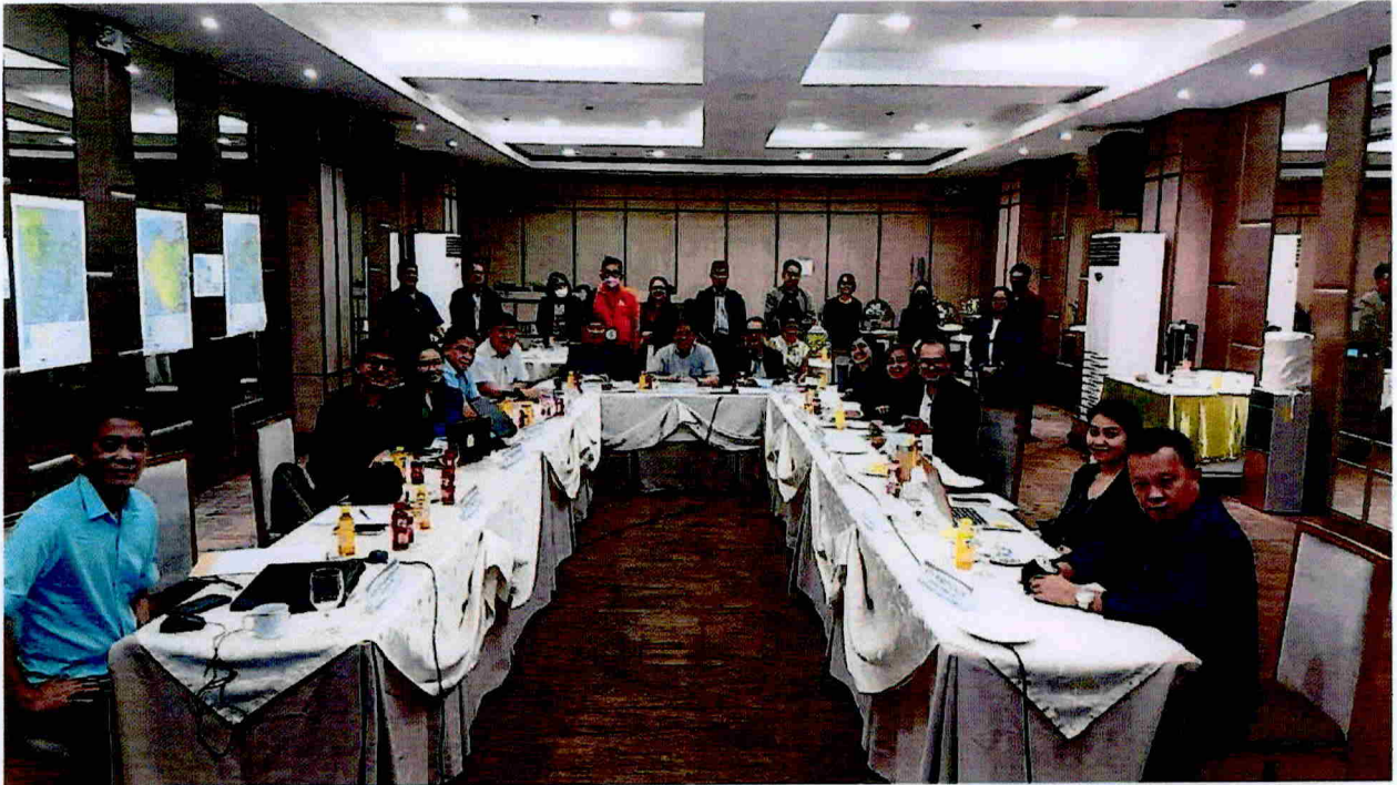
Project Management Committee (PMC) members and participants pose for a group picture