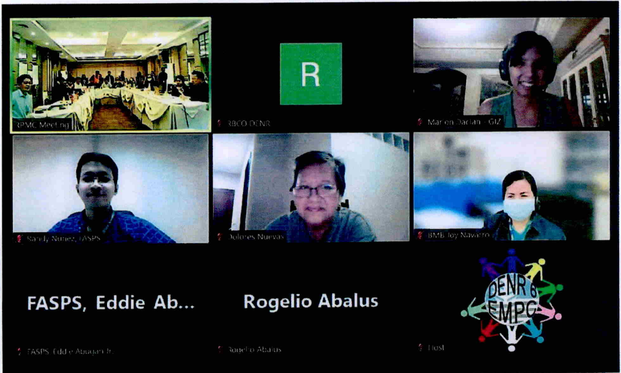
Online participants during the 2nd Semester PMC Meeting via Zoom platform