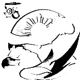
56th ASEAN Day logo 1.png 3387K