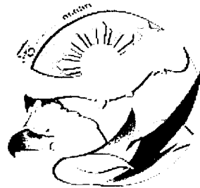
56th ASEAN Day logo 5.png 273K