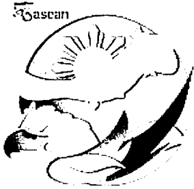
56th ASEAN Day Logo 3.png 3160K