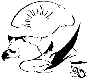
56th ASEAN Day Logo 2.png 3372K