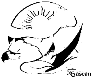
56th ASEAN Day logo 4.png 3149K