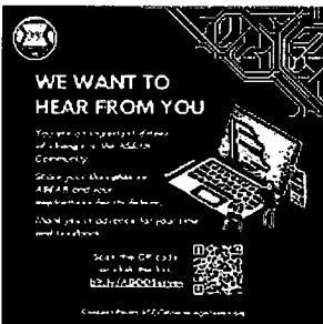
Infographic 2.jpg 1630K