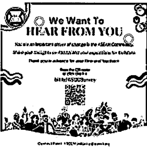
Infographic 3.jpg 1833K

[Final] To ASCC Sectoral Bodies. Letter from DSG ASCC on the Launch of the ASCC Survey on the Post-2025 Agenda.pdf 540K