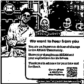
Infographic 1.jpg 2280K